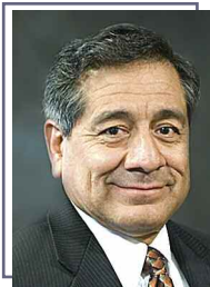
George Guerrero El Pomar Foundation