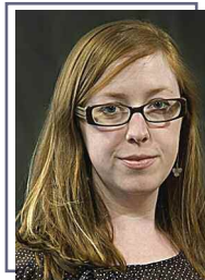
Bettina Swigger Festival Mosaic